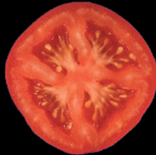
Cong et al. 2008